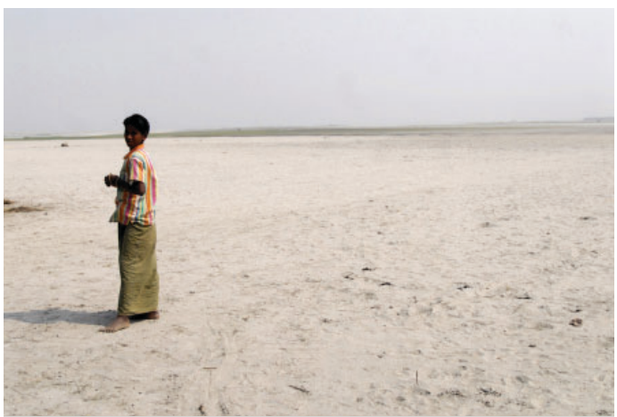
This boy is standing in the middle of the dry river bed of the Brahmaputra river. During the rainy season, the river flows up to the top of the embankments.

campaign and training materials, school programmes and community initiatives. Noting participation in a rally and media responses, she highlighted the importance of lobbying and advocacy.