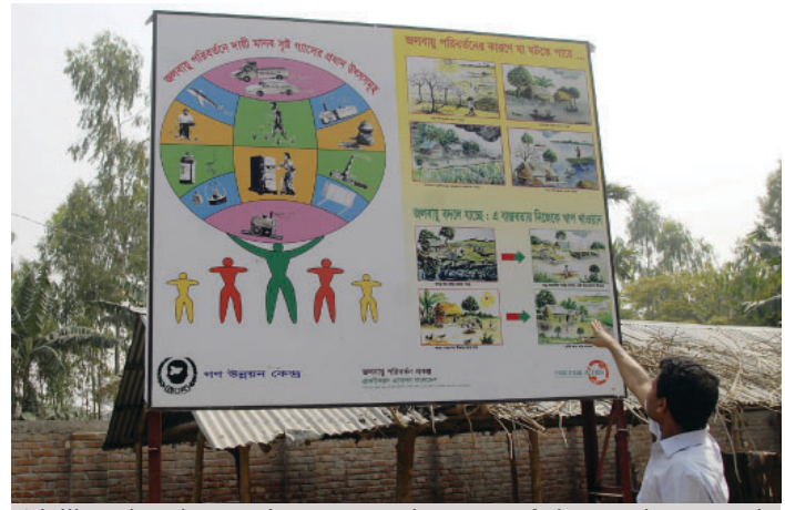
A billboard explaining the causes and impacts of climate change, and what can be done to adapt to these impacts.

The subsequent three days of discussions in Dhaka were structured around two themes: climate change science and adaptation, and mainstreaming and partnership. Introductory panels were followed by parallel technical sessions consisting of presentations and discussions. Reports from the technical sessions were then presented to plenary, and followed by observations by panelists. Under climate change science and adaptation, technical sessions addressed: agriculture, drought and food security; extreme events; and health and climate change. Under mainstreaming and partnership, technical sessions addressed: tools and methods; extreme events; communication and knowledge; and mainstreaming and partnerships. A final panel discussion revolved around two themes: scaling up, capacity building, partnership and mainstreaming; and supporting community-based adaptation. This was followed by concluding remarks from keynote speakers and guests. Workshop outputs include: a two-page