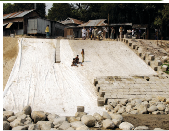
River bank protection activities along the Brahmaputra River, which completely dries up during the dry season and floods over during the rainy season.

ensuring sustainability and measuring the success of a project. They also discussed: the problem of global seed distribution and seed provision; gender-specific knowledge; the challenge of incorporating lessons learned into government policies; questions of land tenure; and how to influence local decision making. On interacting with under-resourced service providers, comments were raised on the possible role of civil society and decentralized service provision and accountability. On measuring a project's success, presenters noted the need for appropriation of the project by the community and availability of resources for evaluation for a certain amount of time after the project's completion. They also stressed the need for long-term institutional support as adaptive capacity building requires a long-term approach.