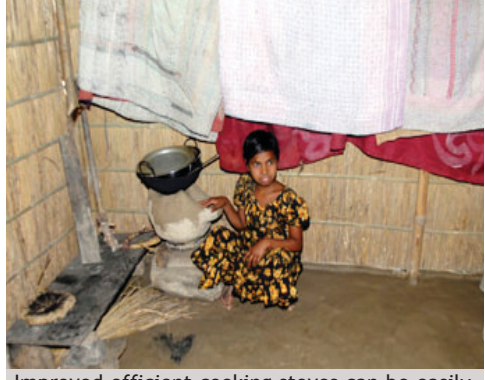
Improved efficient cooking stoves can be easily moved during flood seasons.

climate change and different priorities. He said mainstreaming adaptation requires intersectoral support from all relevant government institutions, and stressed linking community and government